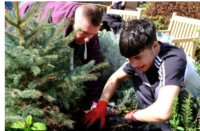
Pictured above: One of our young people taking part in the 'venture with confidence' programme