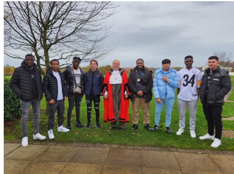
Pictured above: here's a great photo of some of the young UASC we've supported, photographed with the Mayor at last year's Star Awards