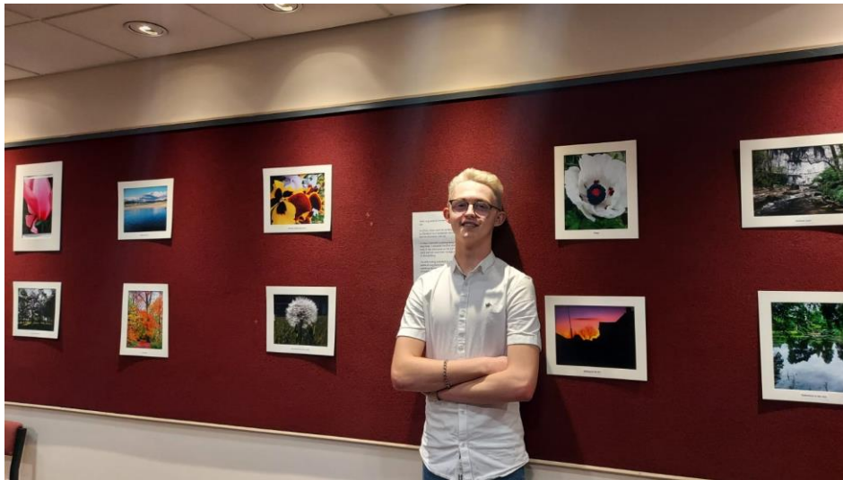
Pictured above: Cared for children and young people displayed their artwork at an art exhibition